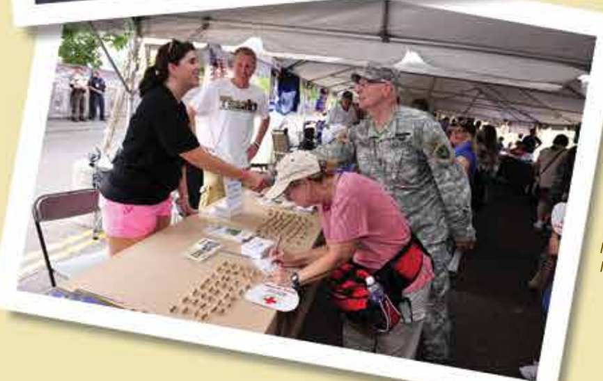
MMAF at the Minnesota State Fair