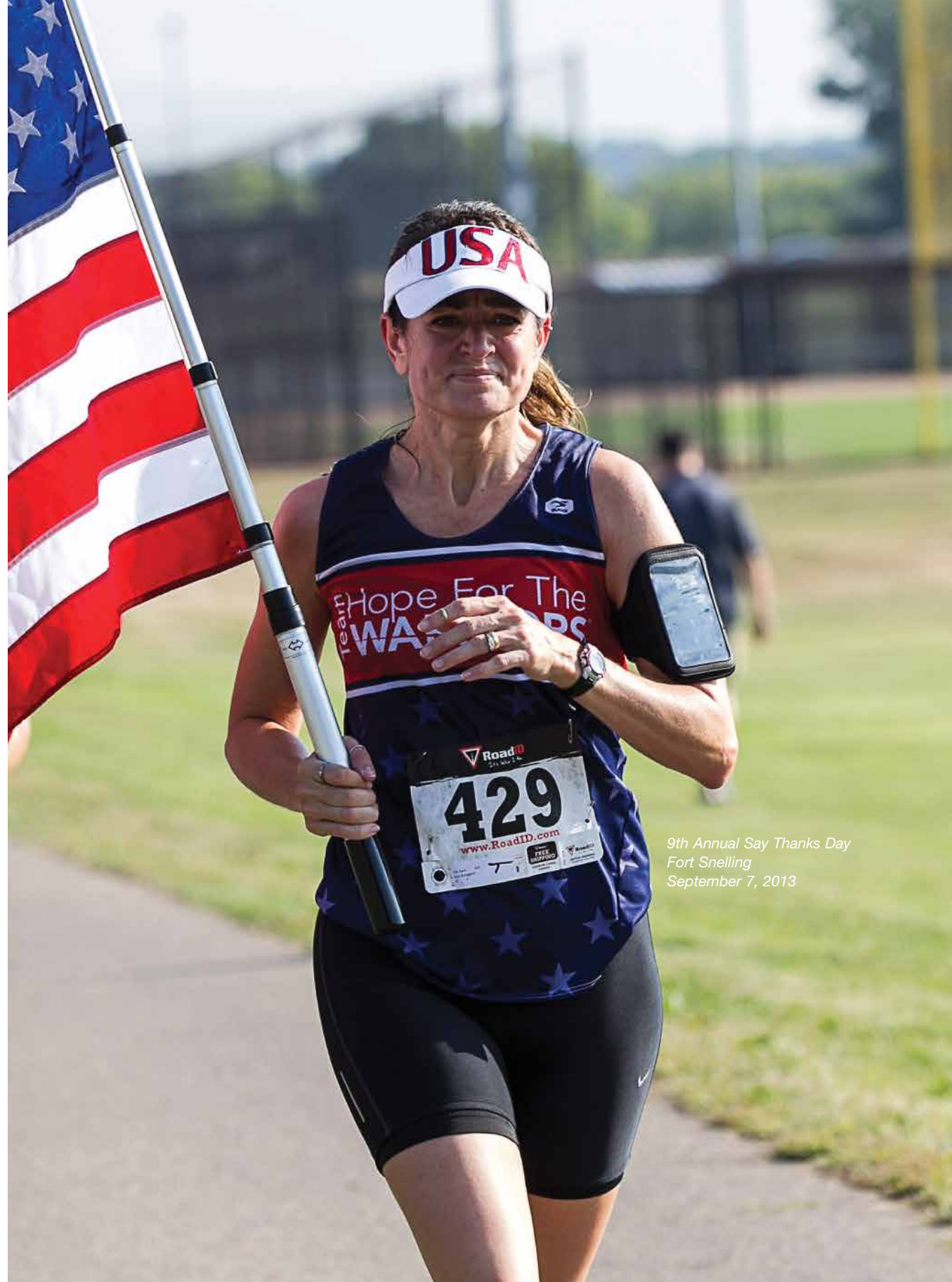
9th Annual Say Thanks Day Fort Snelling September 7, 2013