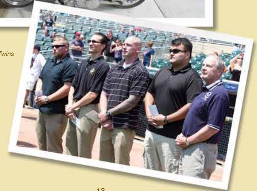
Minnesota Twins Military Day