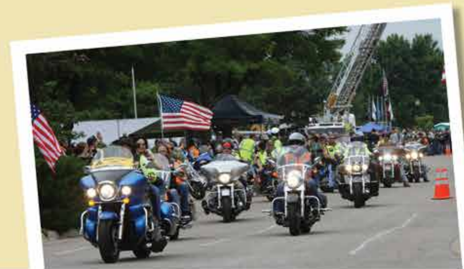
8th Annual Patriot Ride, Ham Lake, Minnesota