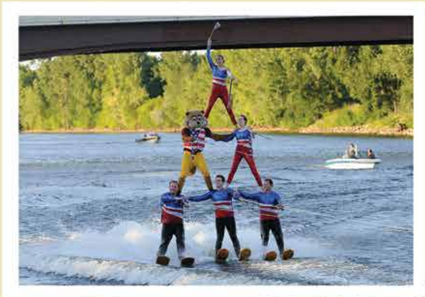
Twin Cities River Rats Water Ski Show Team