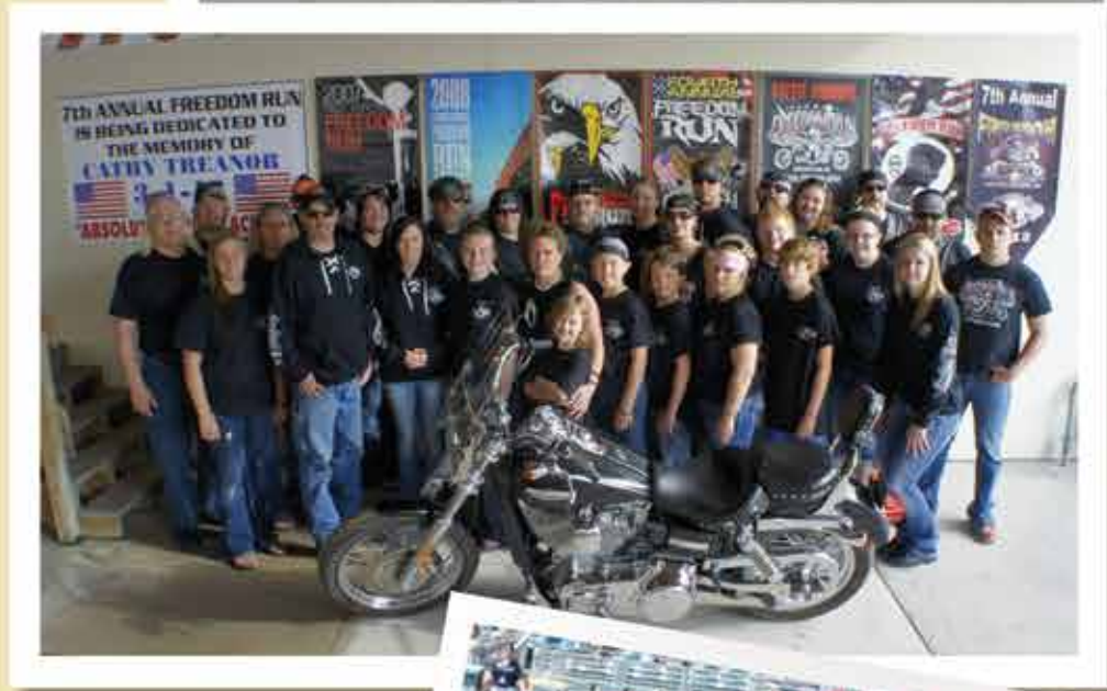
Annual Freedom Run, Minnesota Lake, Minnesota