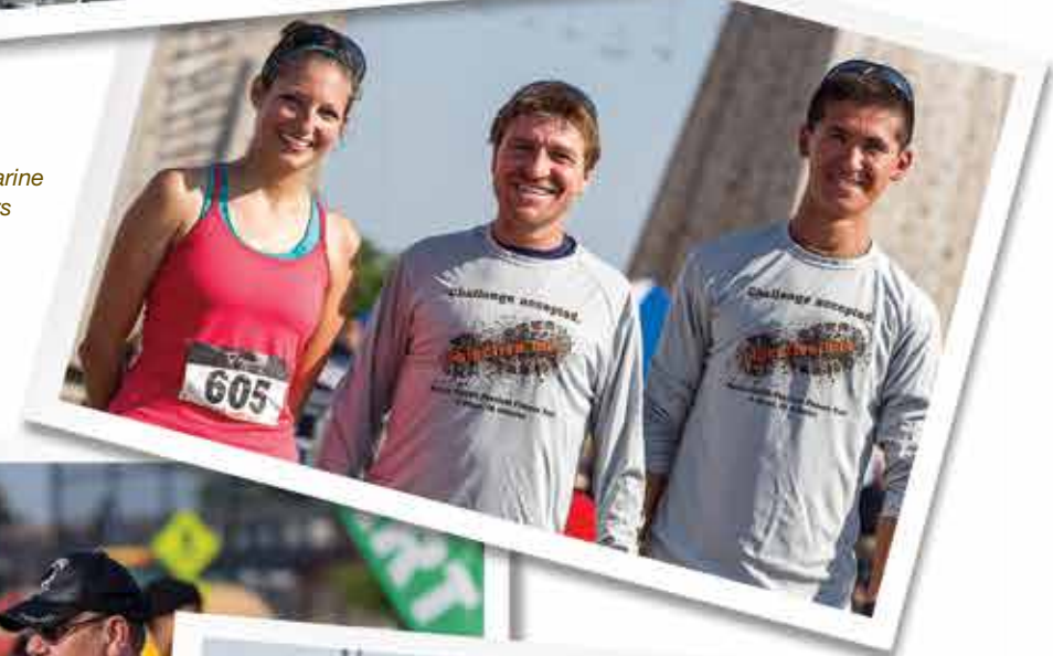
5K and 10K Marine RECON winners