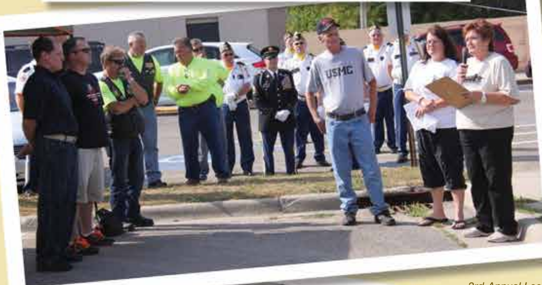
3rd Annual Leech Lake Ride for Vets